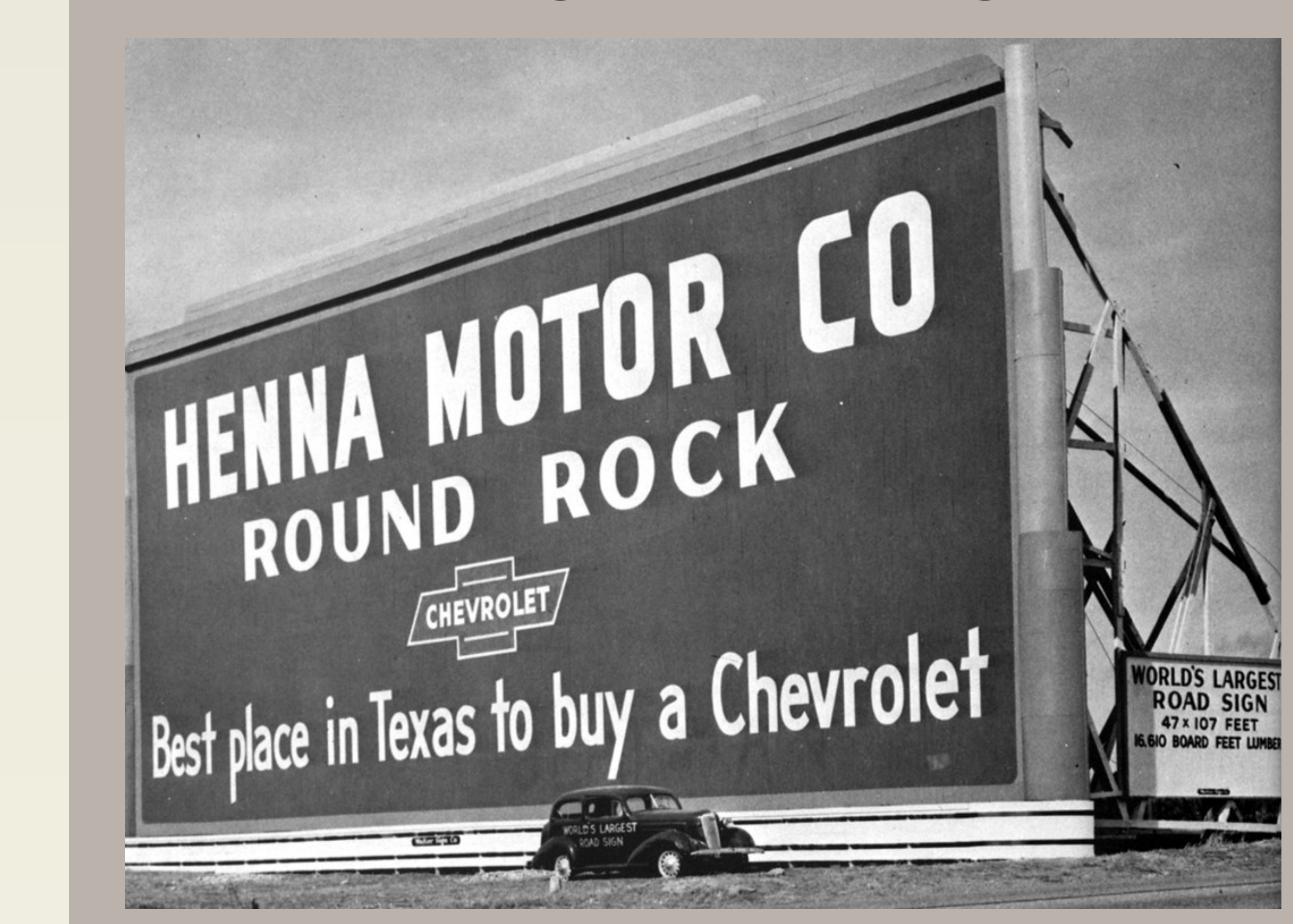
The "world's largest road sign," built in 1938, advertising Louis Henna's car dealership on South Mays Street.