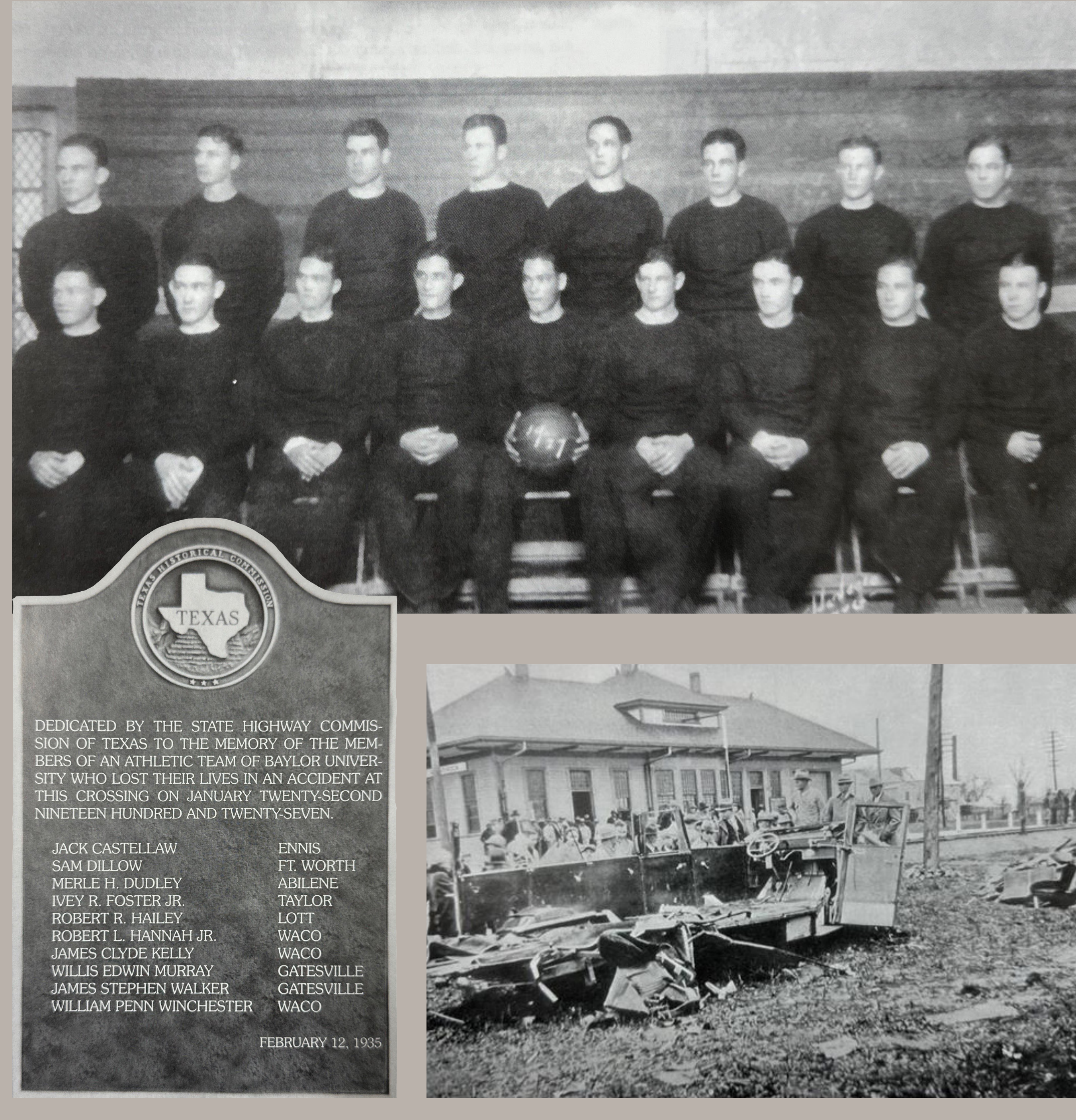
Clockwise from top: The 1927 Baylor Basketball team, photo from the bus crash, Immortal Ten Bridge plaque.