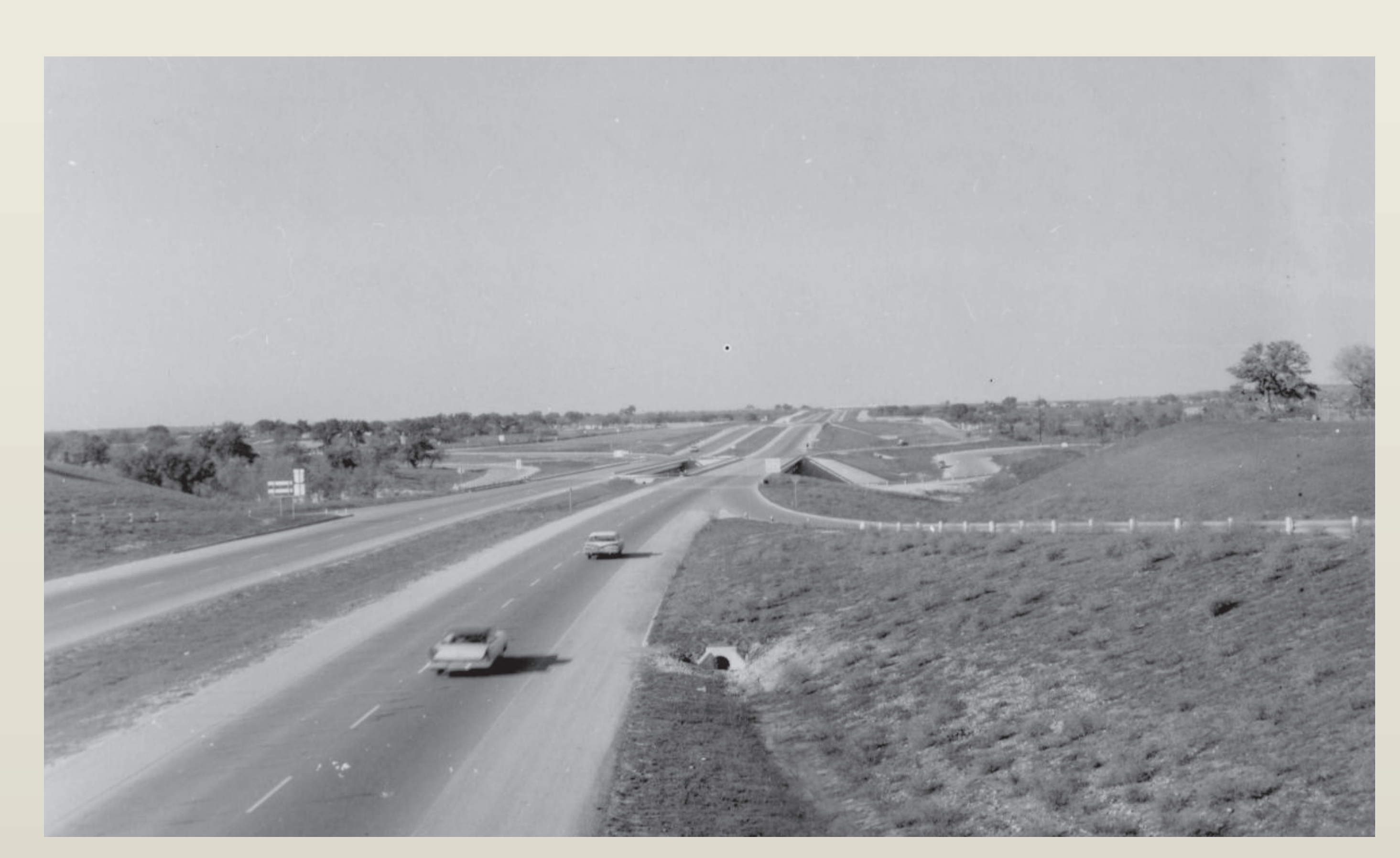
Northbound I-35 from the 620 overpass. Photo taken soon after completion in 1960.

In the 1950s, the planners for the Interstate Highway System proposed that I-35 would run from Dallas to Austin through Taylor. However, the plan faced opposition from Taylor leaders who feared I-35 would negatively impact their town and farmland. In contrast, Round Rock leaders saw I-35 as an economic opportunity and lobbied to route the highway through Round Rock. The highway attracted new businesses and residents to Round Rock. It also required relocation or demolition of buildings in its path.