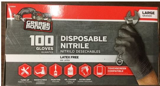
1 Box of Gloves