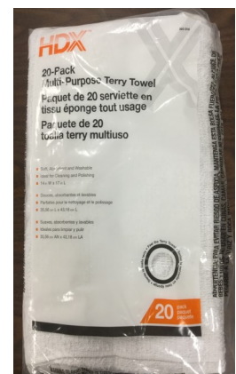
20 Terry Towels

Round Rock City Hall 221 E. Main Street Round Rock, Texas 78664