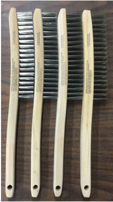
4 Wire Brushes