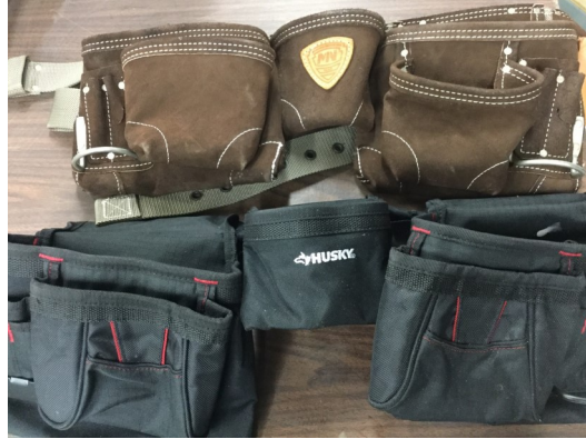
2 Tool Belts