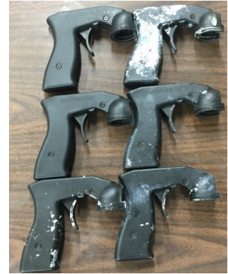
6 Spray Nozzles