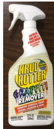
2 Paint Removers