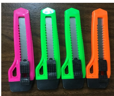
4 Retractable Knives