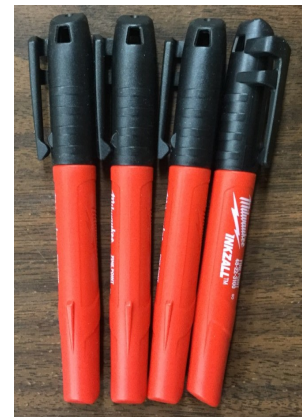
4 Black Markers