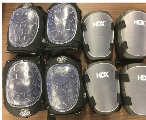
8 Pairs of Kneepads