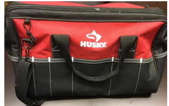
2 Husky Carrying Bags

Round Rock City Hall 221 E. Main Street Round Rock, Texas 78664