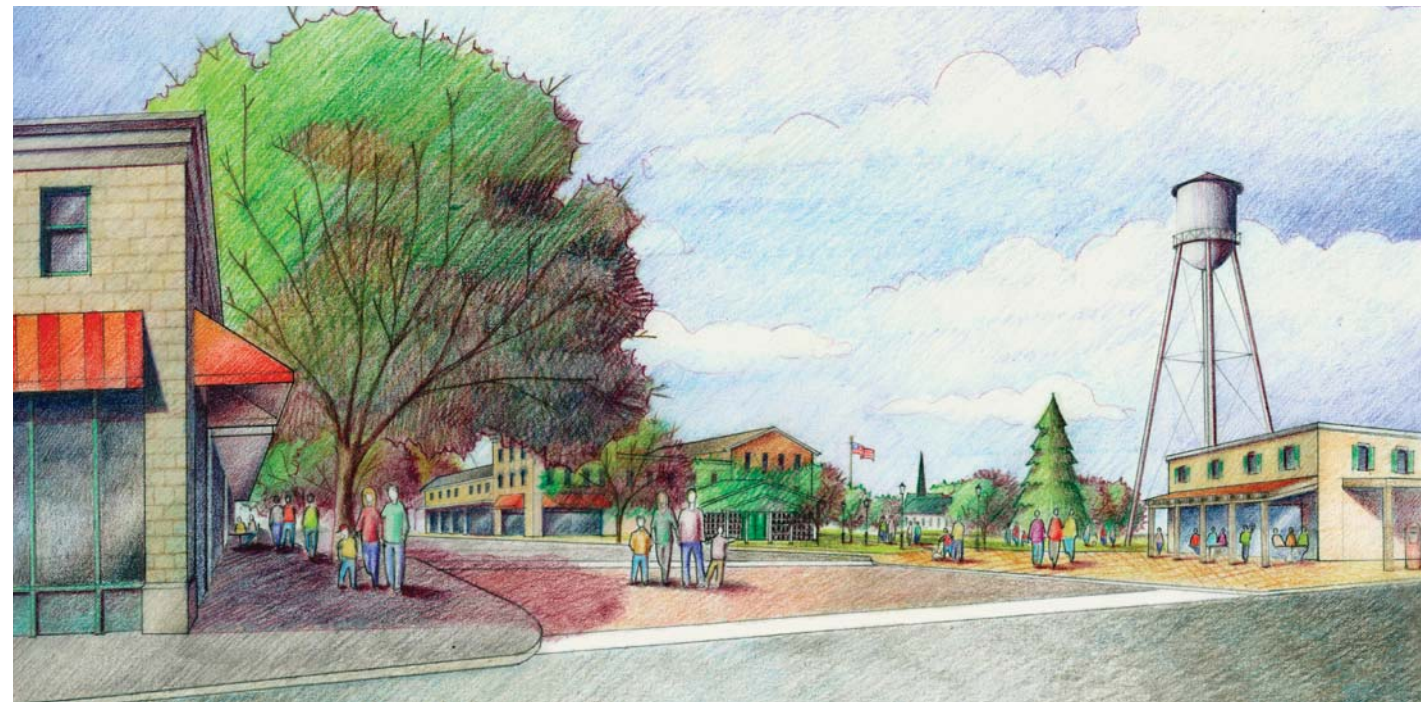
Rendering of Town Green and water tower as seen from Mays Street facing west.