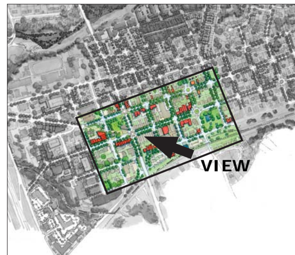
View of rendering to the right